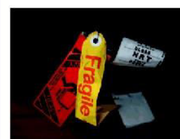
Retail tag labels