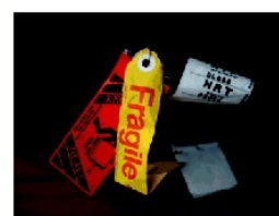
Retail tag labels