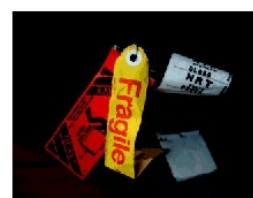
Retail tag labels